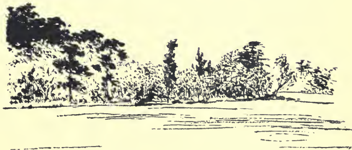
Lake Virginia water where their Majesties after take tea